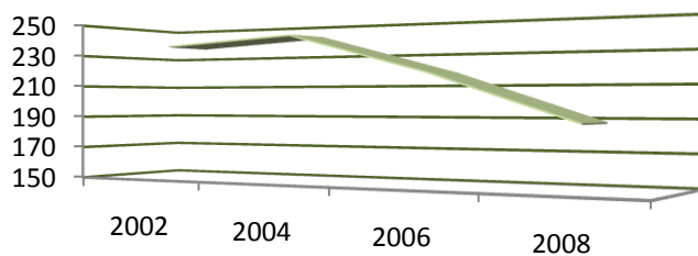
Figure 7: Carbon emissions in milestone years ('000 tonnes)

Dairy UK's subsidiary, Dairy Energy Savings, administers the CCA for the dairy sector. Each year, this activity helps reduce emissions and save the sector £4m in rebate on the Climate Change Levy